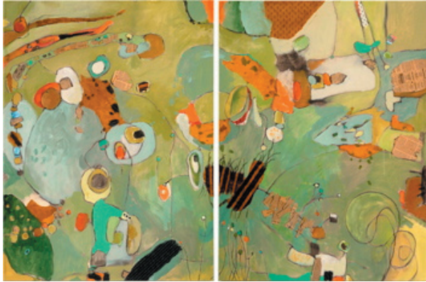
Sur La Table diptych by Nancy Towne Schultz from A Common Thread at The Loft (26)