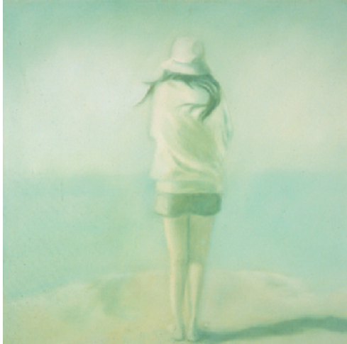
Nancy Crawford Girl on Beach oil on canvas Board Room Gallery